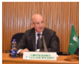
Smail Chergui , Commissioner for Peace and Security

I wish you a successful celebration of the African Border Day.